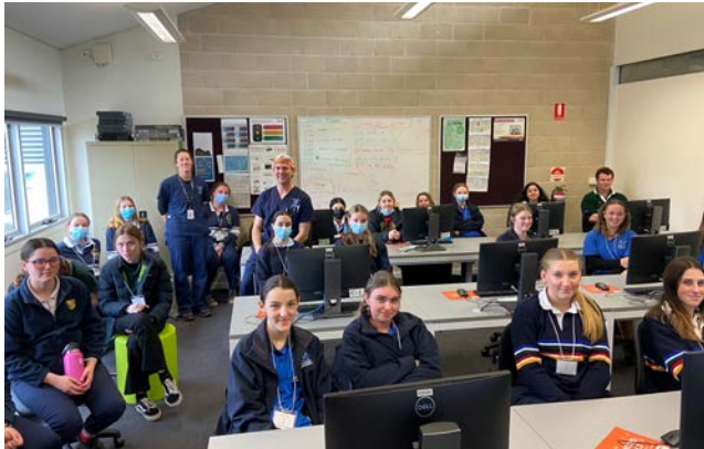
Pictured above: NE Health Careers Forum 2022