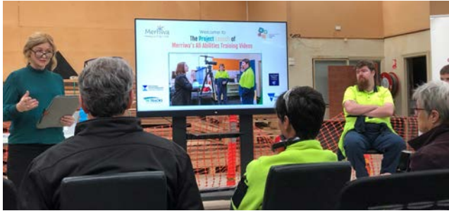
Pictured above: Animation Launch at Merriwa, Wangaratta