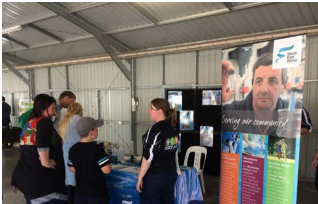
Pictured above: Hands on Trade Careers Expo 2022